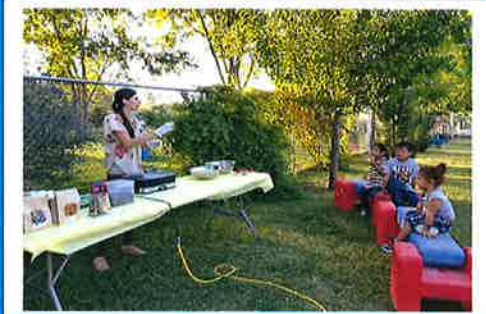
Triple P Cooking Night Fun!